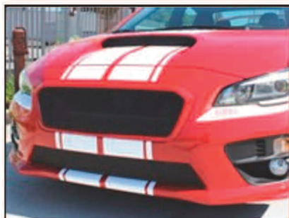
Picture #16: Reinstall back onto vehicle and installation is complete. Shown here with our Black MX Series Upper & Lower Grille Kits.