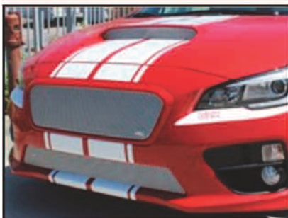
Picture #17: Shown here with our Silver MX Series Upper & Lower Grille Kits.