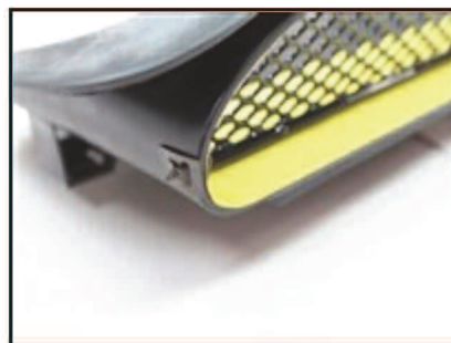
Picture #15: Once all flat nuts are in place, tighten them being sure not to strip the screws.