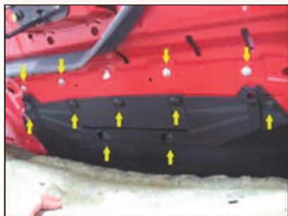
Picture #4: Underneath the sound dampener, Remove the associated clips and nuts holding the hood scoop to the hood. Pointed to with yellow arrows.