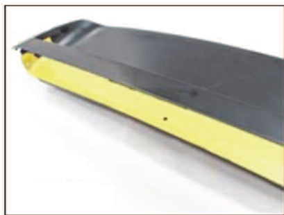
Picture #10: With the mounting points marked, use a 3/16" drill-bit to drill the necessary mounting holes.