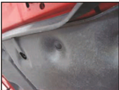
Picture #2: Under the hood, you'll need to partially-remove the sound dampener by removing the upper clips holding it in place.