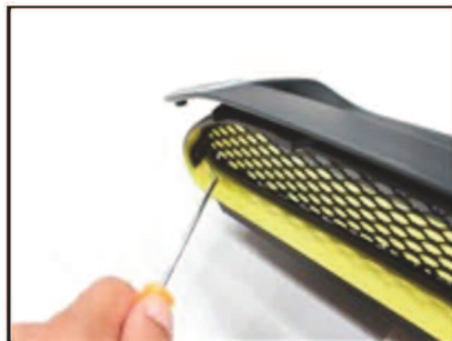
Picture #9: Using a sharp scribe tool, mark the locations of the mounting tabs.

The information contained in this document is meant as helpful guidance only and is subject to change without notice. You are welcome to call, write or email us for more information at any time. Thank you for your interest in our products. This document was published 11/03/14.