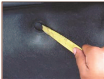
Picture #3: Use a plastic pry-tool or flat blade screw driver to remove the clips.