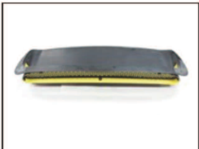
Picture #8: The side tabs sit flush with the edge of the hood scoop, and the center sits about a 3/16" away from the edge.