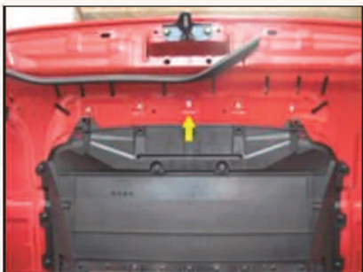
Picture #5: Once all hardware is removed, pinch the center clip in the image to lift the hood scoop away from the hood.