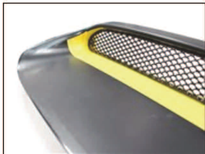
Picture #7: Note the insert sits at a slight angle with the top of the grille behind the top edge of the scoop.