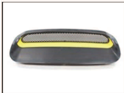
Picture #6: With the Hood Scoop removed from the vehicle, place the mesh insert through the front.