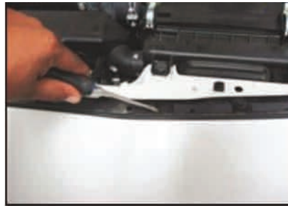
Picture #2: Under the Hood, holding the Bumper is a black retaining bar, you must remove it by popping out the clips with a Flat Screw Driver.