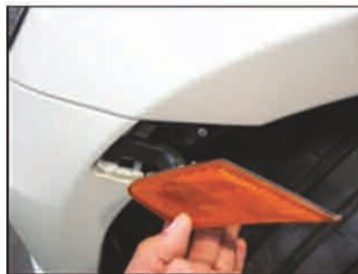
Picture #8: Twist the bulb socket out of the light and pull the side marker out of the bumper. It should come free easily.