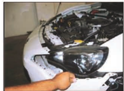
Picture #9: Now you can unclip the bumper from the vehicle by gently pulling away from the vehicle.

The information contained in this document is meant as helpful guidance only and is subject to change without notice. You are welcome to call, write or email us for more information at any time. Thank you for your interest in our products. This document was published 08/21/13.