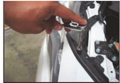
Picture #3: Then Remove the 10mm bolts holding the retaining bar to the core support.