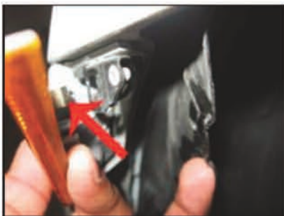
Picture #7: Pop out the side markers by pushing the clip inward, releasing the light. Then, remove the small black clip holding the bumper to the fender right behind the light.