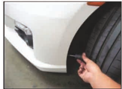
Picture #6: You'll need to remove the (3) clips holding the fender-liner to the bumper with a flat screw driver.