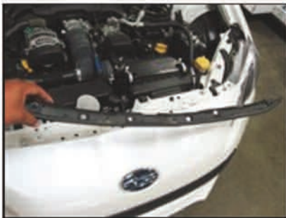
Picture #4: The retaining bar should come right off with all screws and clips removed.