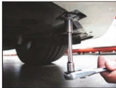
Picture #5: Remove the two bolts holding the bumper to the core support as well as the clips underneath the bumper.