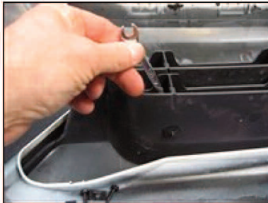
Picture #22: Using a 1/4 inch wrench fasten the grille screws do not over tighten.