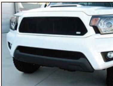
Picture #31: 2012 Toyota Tacoma shown with GrillCraft upper & lower MX-Series black mesh grilles.

The information contained in this document is meant as helpful guidance only and is subject to change without notice. You are welcome to call, write or email us for more information at any time. Thank you for your interest in our products. This document was published 06/30/14.