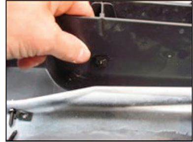
Picture #21: Fasten the lower grille into the bumper with supplied hardware.