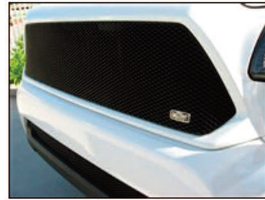
Picture #30: 2012 Toyota Tacoma shown with GrillCraft upper & lower MX-Series black mesh grilles.