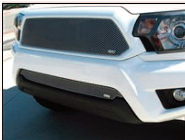
Picture #25: 2012 Toyota Tacoma shown with GrillCraft upper & lower MX-Series silver mesh grilles.