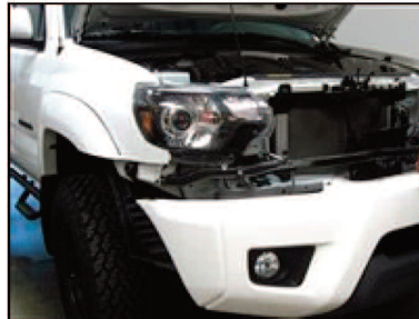
Picture #23: Reinstall bumper cover & upper grille shell onto vehicle.