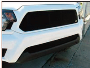
Picture #26: 2012 Toyota Tacoma shown with GrillCraft upper & lower MX-Series black mesh grilles.