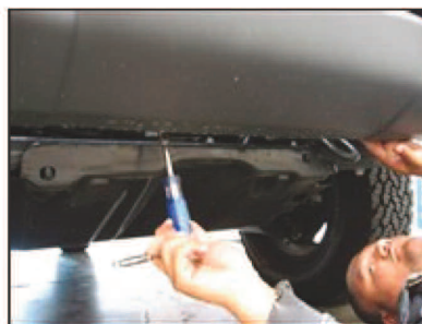
Picture #8: Remove bolts along the front underside of the bumper cover.