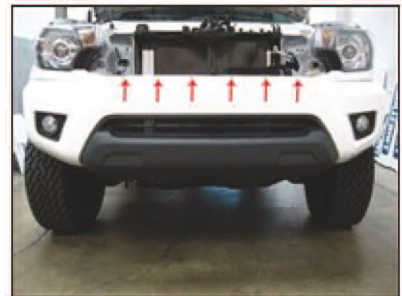
Picture #6: A view of the plastic tab socket location on the bumper cover.