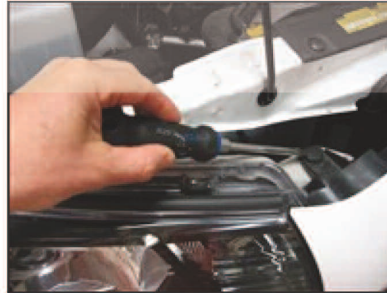
Picture #2: Using a screwdriver unclip the push clips along the top of the grille shell.