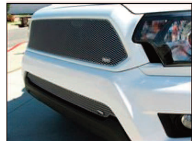
Picture #27: 2012 Toyota Tacoma shown with GrillCraft upper & lower MX-Series silver mesh grilles.

The information contained in this document is meant as helpful guidance only and is subject to change without notice. You are welcome to call, write or email us for more information at any time. Thank you for your interest in our products. This document was published 06/30/14.