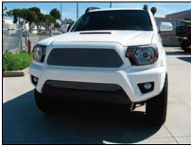
Picture #28: 2012 Toyota Tacoma shown with GrillCraft upper & lower MX-Series silver mesh grilles.