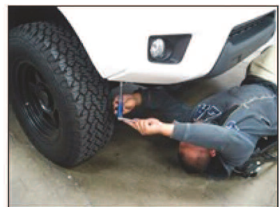
Picture #9: Remove the bolts on the right & left underside of the bumper cover.

The information contained in this document is meant as helpful guidance only and is subject to change without notice. You are welcome to call, write or email us for more information at any time. Thank you for your interest in our products. This document was published 06/30/14.