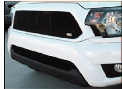
Picture #24: 2012 Toyota Tacoma shown with GrillCraft upper & lower MX-Series black mesh grilles.