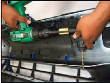
Picture #19: When drilling the mounting holes a drill elbow adapter is needed. The other option is to unclip the lower bumper plastic from the cover in order for the drill motor to clear.