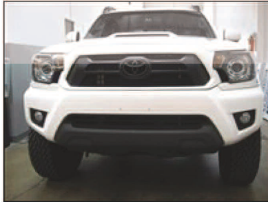
Picture #1: Here is our project 2012 Toyota Tacoma in need of a GrillCraft MX-Series Sport Grille.