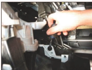
Picture #7: Remove the plastic clips along the top of the bumper cover.