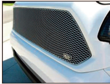
Picture #29: 2012 Toyota Tacoma shown with GrillCraft upper & lower MX-Series silver mesh grilles.