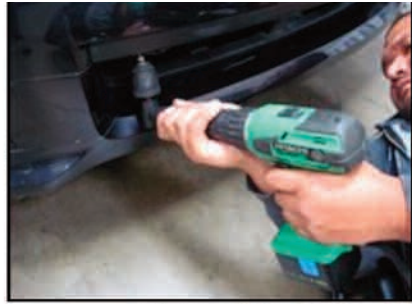
Picture #10: drill holes for mounting screws using 3/16 inch drill bit. The upper holes may require using a 90 degree drilling adapter as shown.