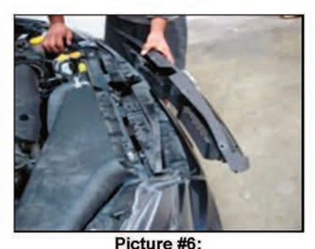
Once all the backside screws are removed the grille shell can then be removed from the vehicle.