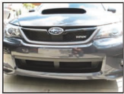
Picture #1: Our project Subaru Impreza WRX in need of a custom mesh grille