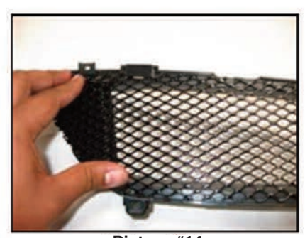
Picture #14: Place the GrillCraft mesh into the factory grille shell as shown.