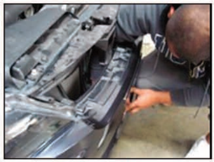
Picture #15: Gain access to the backside of the lower grille by reaching through the upper grille area and fasten screws. Next reinstall upper grille.