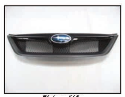
Picture #16: The factory Subaru grille shell with center mesh insert installed.