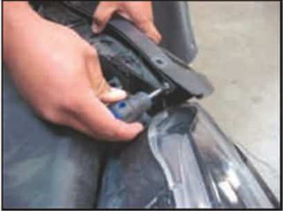
Picture #3: Remove the right & left corner screws located on the back side of the grille shell as shown using a stubby "Short" screwdriver.