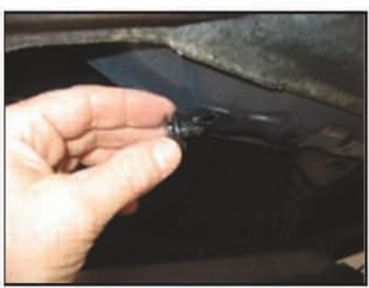
Picture #2: Remove the plastic fastners on the under side of the hood scoop.