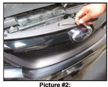
Remove all the plastic fastners along the top of the grille shell.