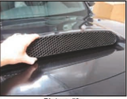
Picture #3: Place the hood scoop grille into scoop opening as shown. While holding in place mark the mounting tab center hole location from the underside.