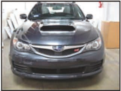
Picture #1: Our project Subaru Impreza / WRX STI in need of a custom mesh grille kit.