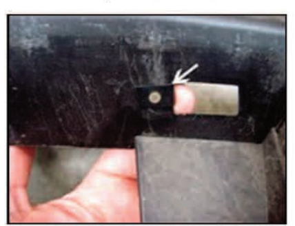
Picture #13: Attach the upper supplied "U" nuts onto the bumper plastic as shown.