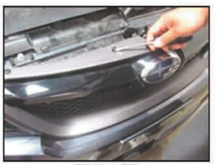
Picture #2: Remove all the plastic fastners along the top of the grille shell.