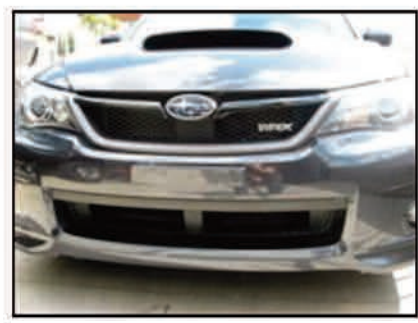
Picture #1: Our project Subaru Impreza WRX in need of a custom mesh grille