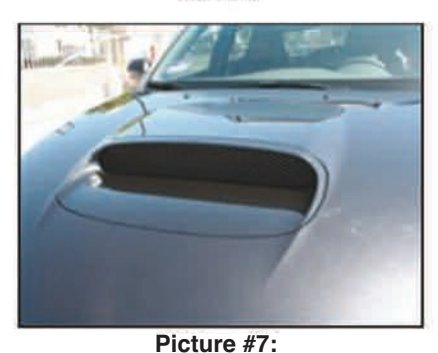
The hood scoop grille will keep all that road debris from entering your motor compartment.