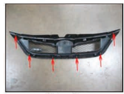
Picture #5: Shown here are the locations of the grille shell screws that must be removed.