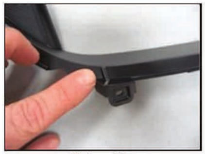
Picture #12: The index tabs on the right & left lower corners of the grille shell must also be removed.