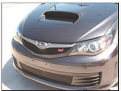
Picture #9: Our Sti shown here with optional upper & lower grilles installed.