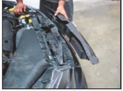
Picture #6: Once all the backside screws are removed the grille shell can then be removed from the vehicle.