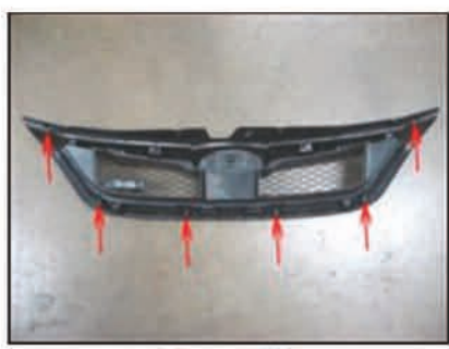
Picture #5: Shown here are the locations of the grille shell screws that must be removed.