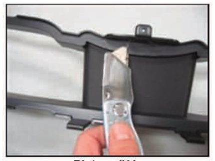
Picture #11: Using a razor also works well in order to shave down the plastic index tabs.